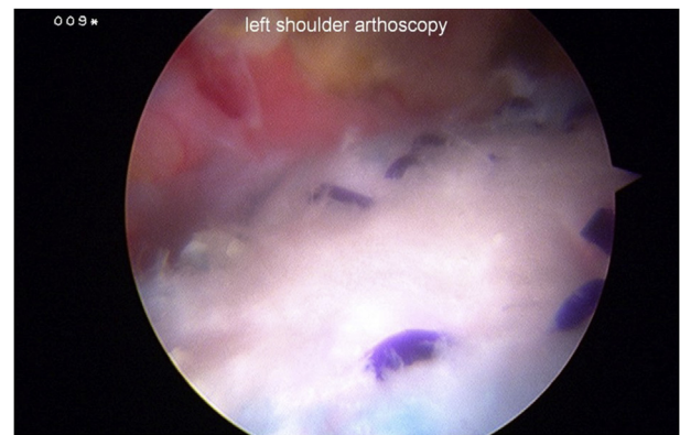
Figure 1. Left shoulder with bioinductive implant applied over rotator cuff repair, as viewed from posterior portal with patient in lateral decubitus position.

Baseline data included medical history of diabetes, smoking, worker's compensation status, and shoulder injury. Details including timing of injury, history of trauma, duration of symptoms and previous treatments were recorded. Operative data included Cofield grade, 18 concomitant shoulder pathology, and additional surgical procedures. PROs including American Shoulder and Elbow Surgeons (ASES), single-assessment numeric evaluations (SANE), Veterans RAND 12-Item (VR-12) mental and physical components, and Western Ontario Rotator Cuff (WORC) scores were collected before surgery and assessed for postoperative improvements at 2 weeks, 6 weeks, 12 weeks, 6 months, and 1 year, which constituted the study's primary efficacy variable. Secondary efficacy variables were postoperative recovery parameters including time in a sling, completed number of physical therapy visits, and return to work (employed patients only), driving, and athletics (including overhead athletics); as well as the occurrence of serious complications (defined as serious adverse events, serious adverse device deficiency, and/or revision or reoperation surgery on index shoulder), which was documented throughout the course of the study by the investigators.