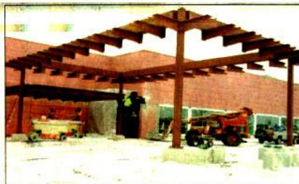
Rockford Orthopedic Associates' next clinic is under construction on East Riverside Boulevard in Rockford.

Leaders of both groups said they belonged to the same professional circles for many years but started seriously discussing